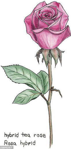
hybrid tea rose Rosa hybrid

and hear your call this fall go forward with a new frame of mind being kind at any age sets the stage for joy